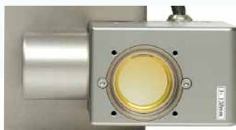
New i-Tech RapidScan coding technology for ultra fast performance